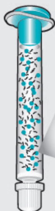
VICAM DONtest TAG Column